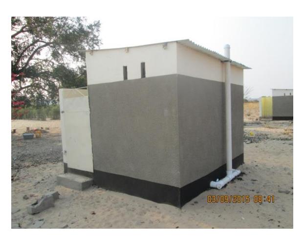
Front and back of the VIP (ventilation improved pit latrine).