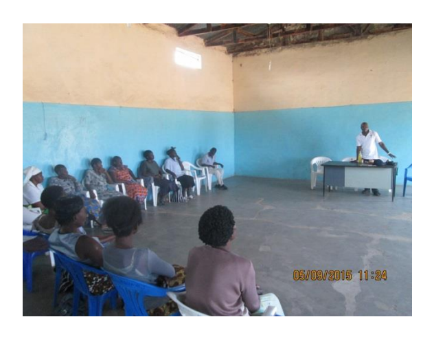
Official introduction of the facility and a picture of the information meeting on hygiene and toilet use.